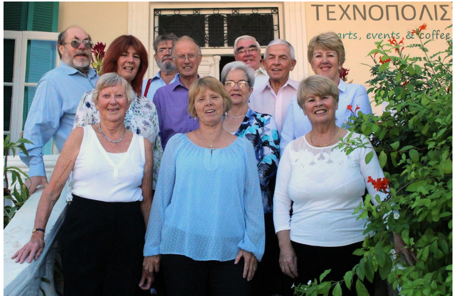
Sine Nomine at Technopolis, November 2017

The KVHA does not necessarily endorse the views expressed in this publication.